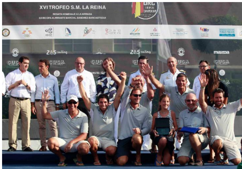
Low Noise team accepting awards from Her Majesty Queen Sofia