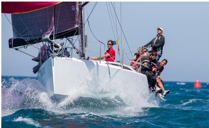
Low Noise at speed downwind