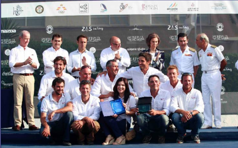
Her Majesty Queen Sofia presenting awards to Natalia team